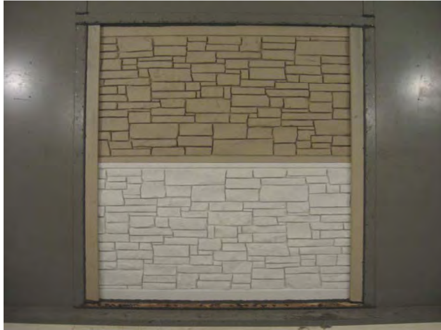
Receive Room View of Installed Specimen